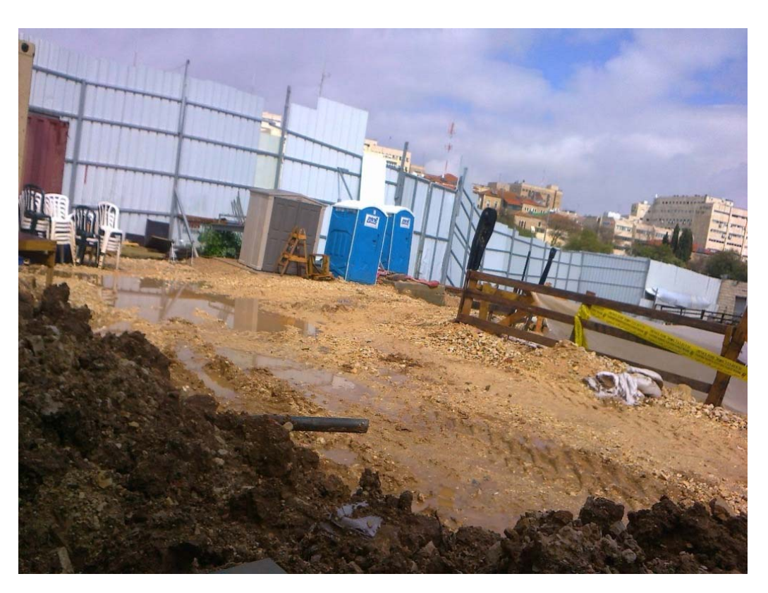
IAA excavation pit inside SWC construction showing inner enclosure wall and portable toilets rented for use by IAA teams onsite

IAA excavation pit inside SWC construction site covered with plastic tarp, supplied with dedicated electrical current for operating heavy machinery and surrounded with warning tape.